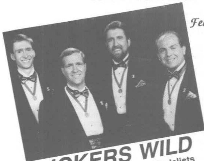
JOKERS WILD 1993 International Silver Medelists