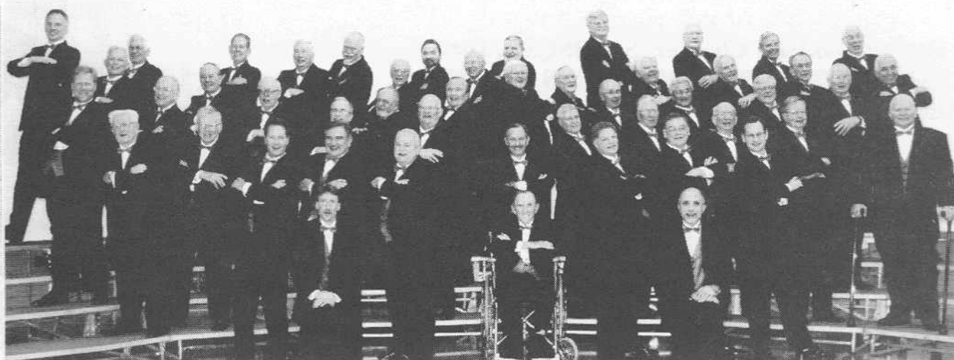
THE GENTLEMEN SONGSTERS CHORUS