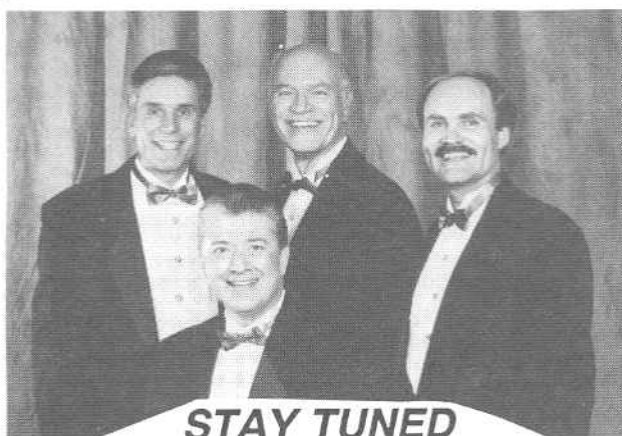
STAY TUNED 1991 Pioneer District Champions

All Seats reserved - $10.00 ORDER TODAY! For tickets and information, call (313) 562-1989 or (313) 598-0199