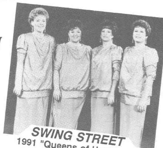
SWING STREET 1991 "Queens of Harmony"

All Seats reserved - $10.00 ORDER TODAY! For tickets and information, call (313) 562-1989 or (313) 598-0199