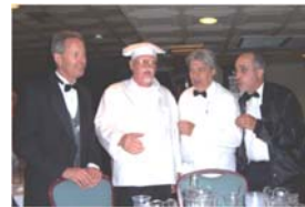
Singing in a quartet is a fun option.

Basically, we are looking for men of all ages who enjoy singing and can enjoy four-part harmony. We don't necessarily expect professional singers. In fact, even if you don't read music we have several ways to help you learn your part.