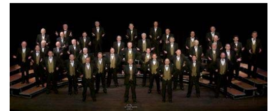
Formal competition photograph. There is a place for you on the risers.

Drop in on a Monday night and check out all of the activities. We think you'll like what you see and hear. We know you'll meet some of the best friends you'll ever know.