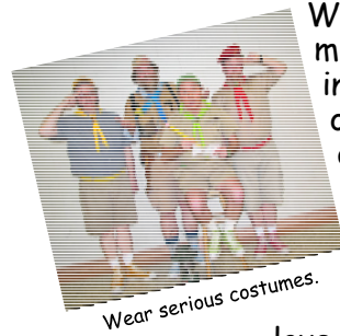
Wear serious costumes.