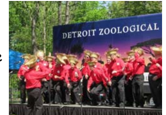
Singing at the Detroit Zoo.

We enjoy competing in two Pioneer District contests every year and have been the Pioneer District Chorus Champions multiple times. We put on a fantastic annual show in September as well as performances at a multitude of civic and private functions around Southeastern Michigan.