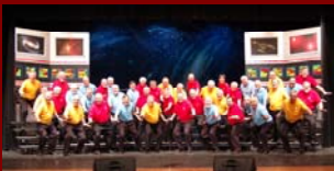
On stage in our "Barbershop in Space" show. Looks like fun, huh?

Singing at the Detroit Zoo Annual September Show