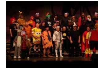
Our "What's Up DOC" cartoon show.

We are an eclectic group of men that are drawn together by the love of singing.